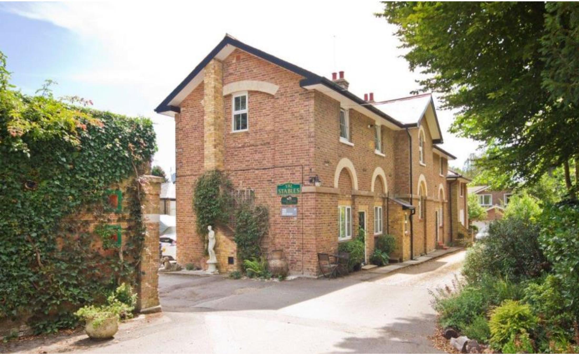
A one bedroom apartment set within a private development in Chorleywood Dog Kennel Lane, Chorleywood, WD3 5EL