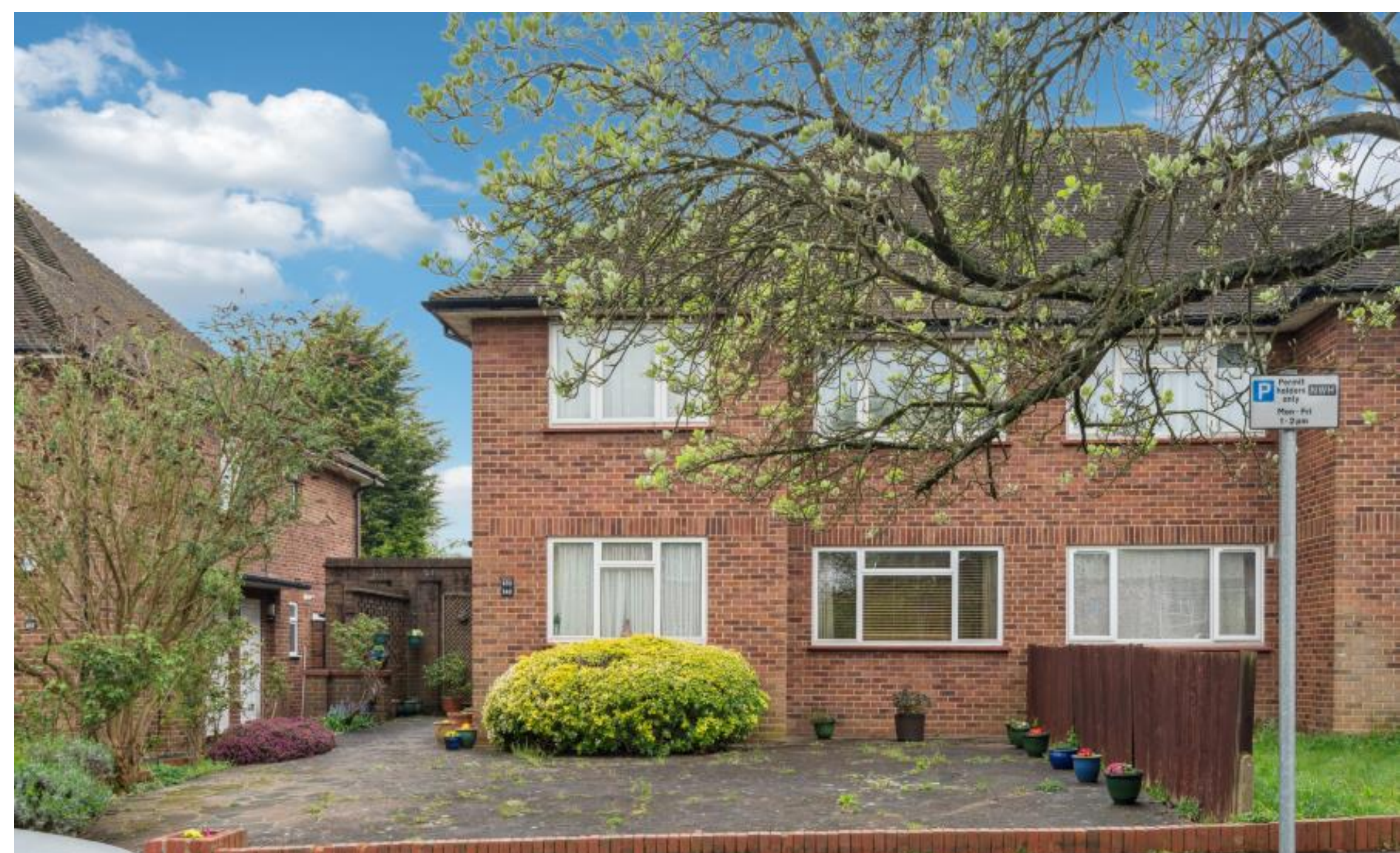
A two bedroom first floor maisonette with a large private garden Tolcarne Drive, Pinner, HA5 2DR