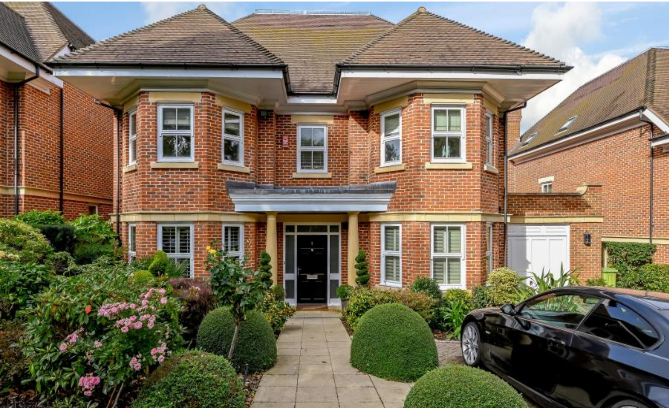
AN OUTSTANDING FOUR/FIVE BEDROOM DETACHED FAMILY HOME Glynswood Place, Northwood, Middlesex HA6 2RE