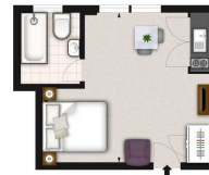
Illustration For Identification Purposes Only. Not to Scale *As Defined by RICS - Code of Measuring Practice

Approx. Gross Internal Area* 275 FT 2 = 25.55 M 2