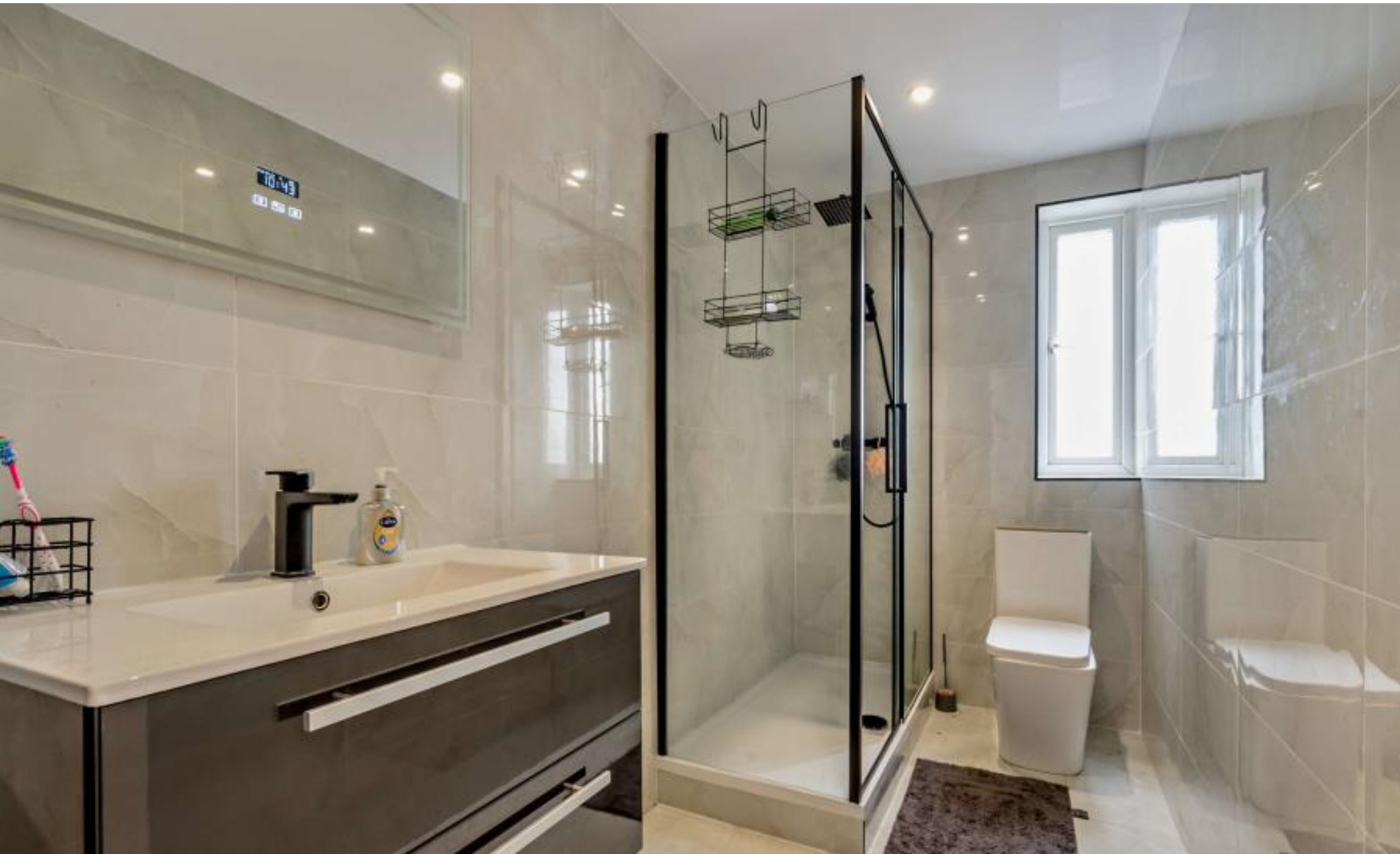
A two bedroom apartment conveniently located for Northwood town centre Green Lane, Northwood, Middlesex HA6 2XS