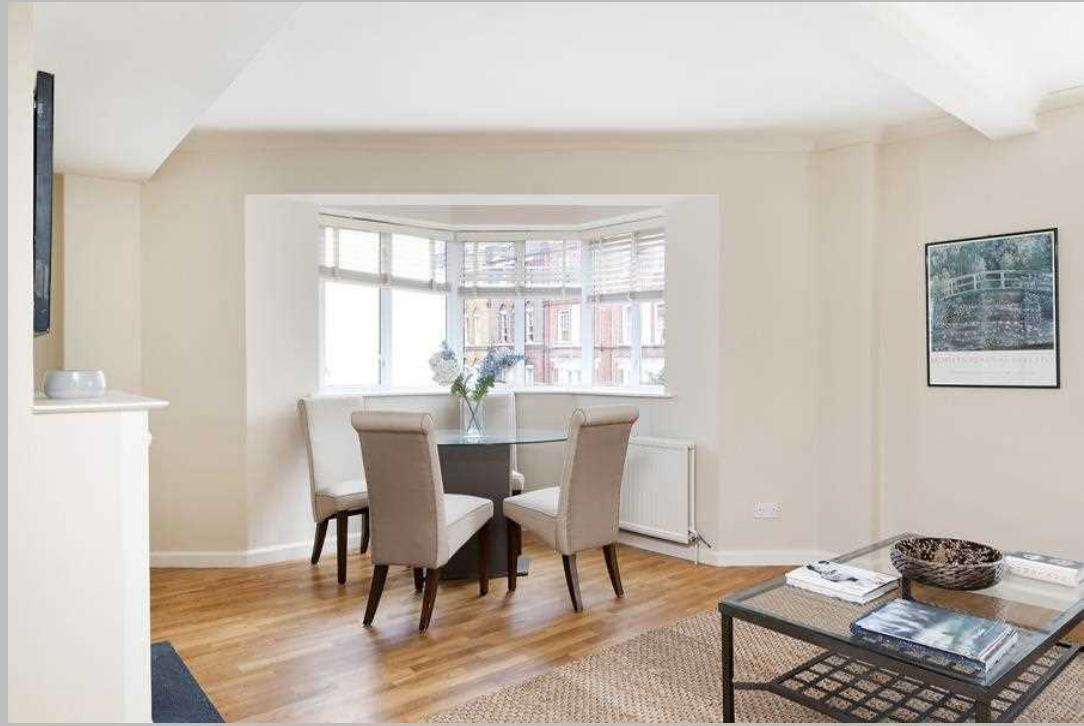
A beautifully finished one bed flat in an ideal Chelsea location