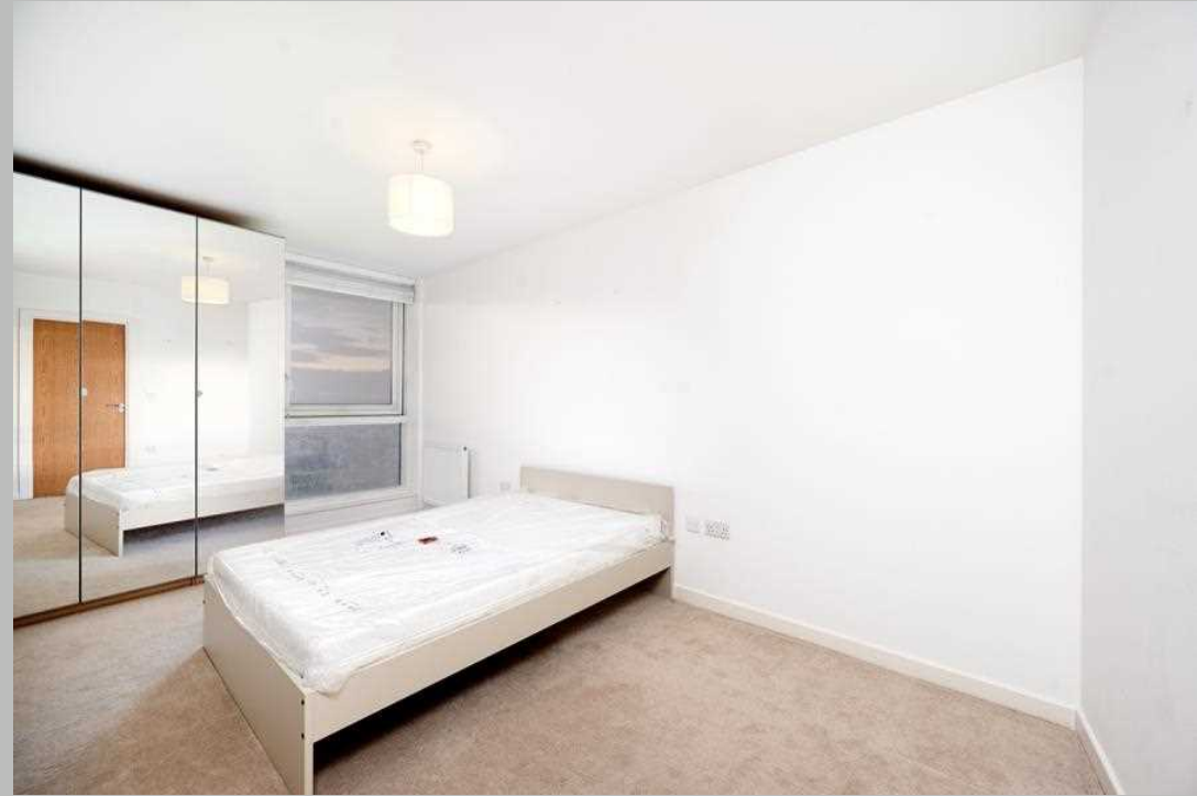
A fantastic two bed two bath 21st floor apartment with stunning views across London