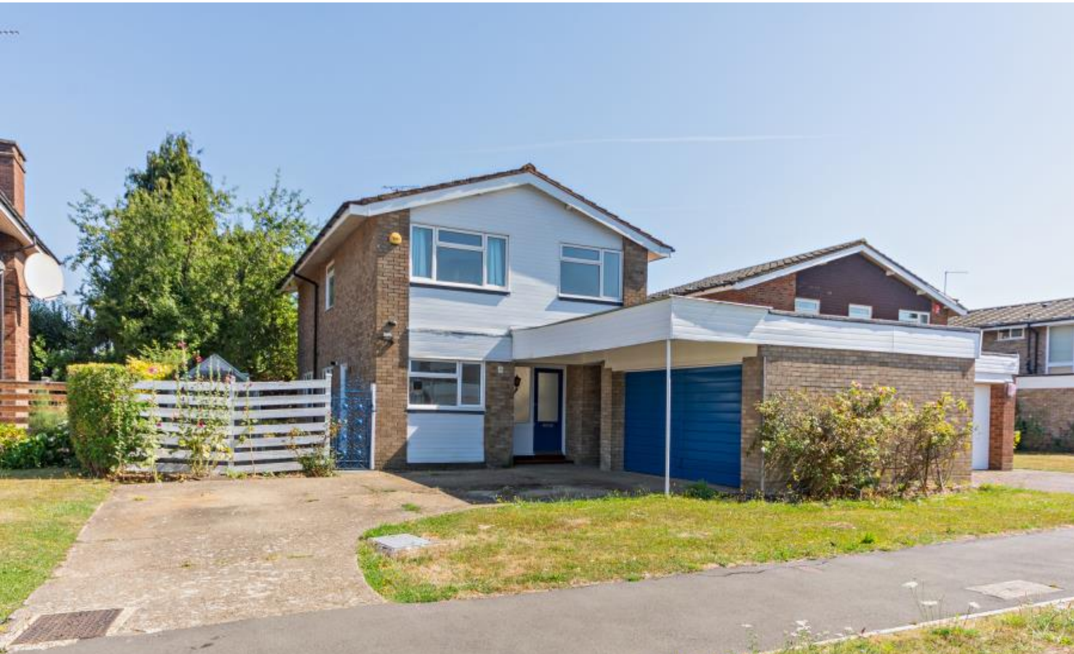
A four bedroom detached family home in a sought after location Albury Drive,Pinner, HA5 3RH