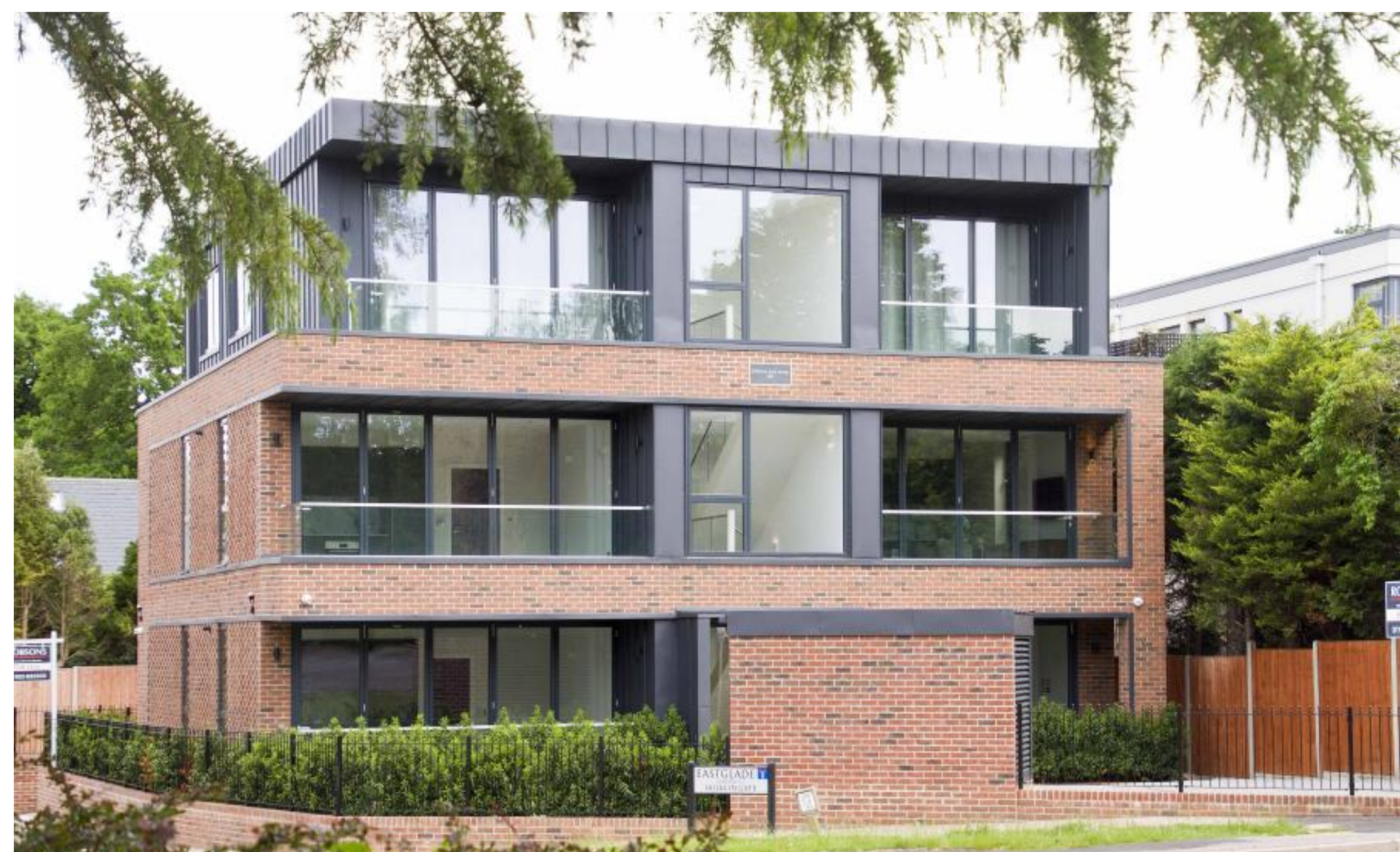
A stunning 2 bedroom ground floor apartment set within a unique development Eastbury Avenue, Northwood, HA6 3FH