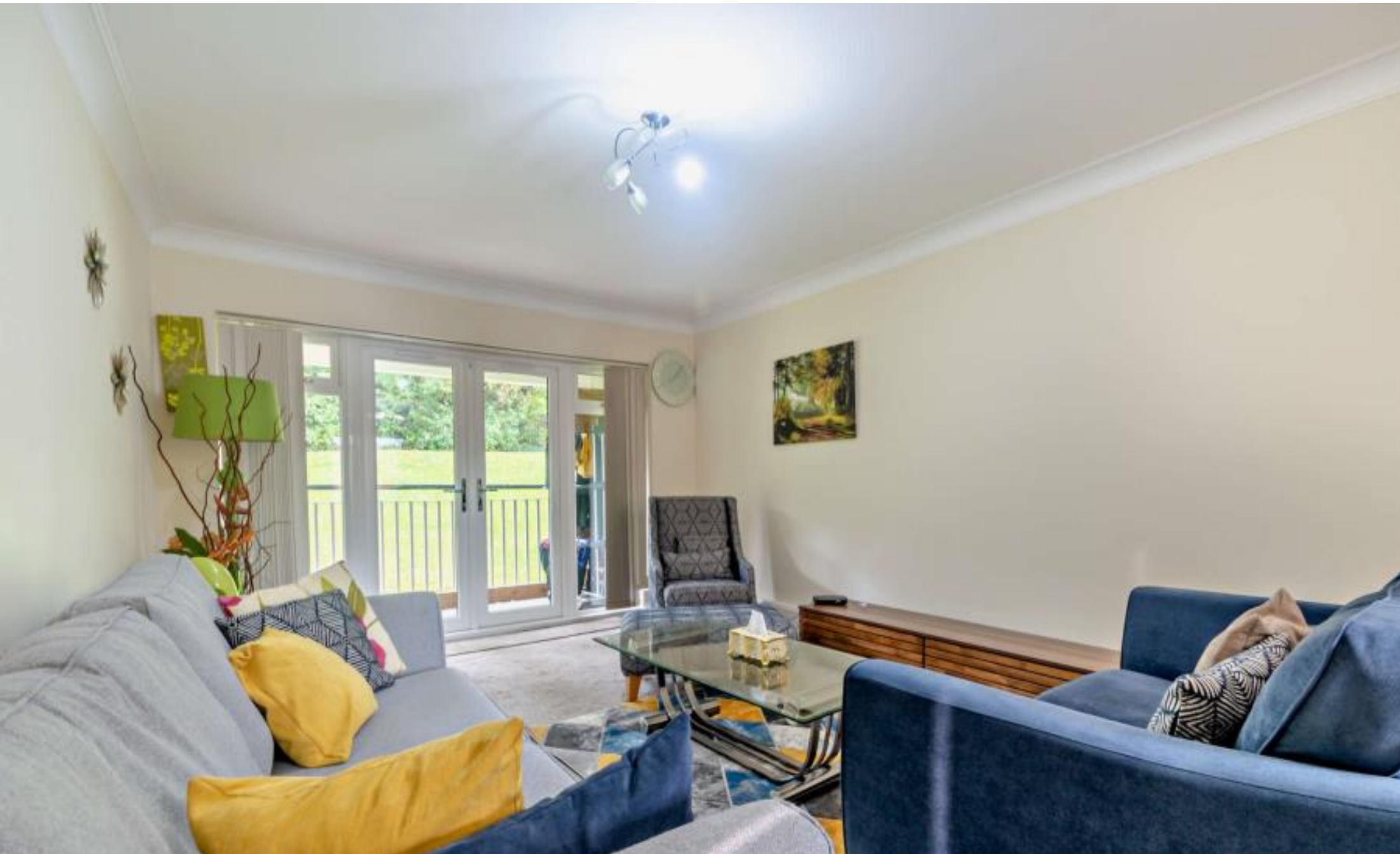
A well presented two bedroom ground floor apartment with private patio Eastbury Avenue, Northwood, HA6 3NF