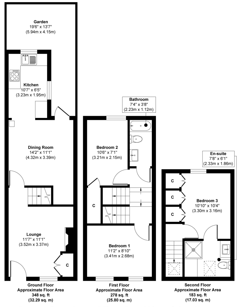
Approx. Gross Internal Floor Area 809 sq. ft / 75.12 sq. m