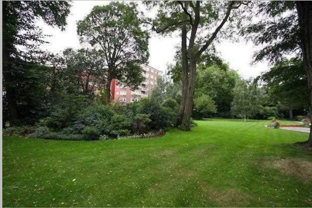
A beautifully presented two-bedroom apartment situated within Kingston House South in Knightsbridge.