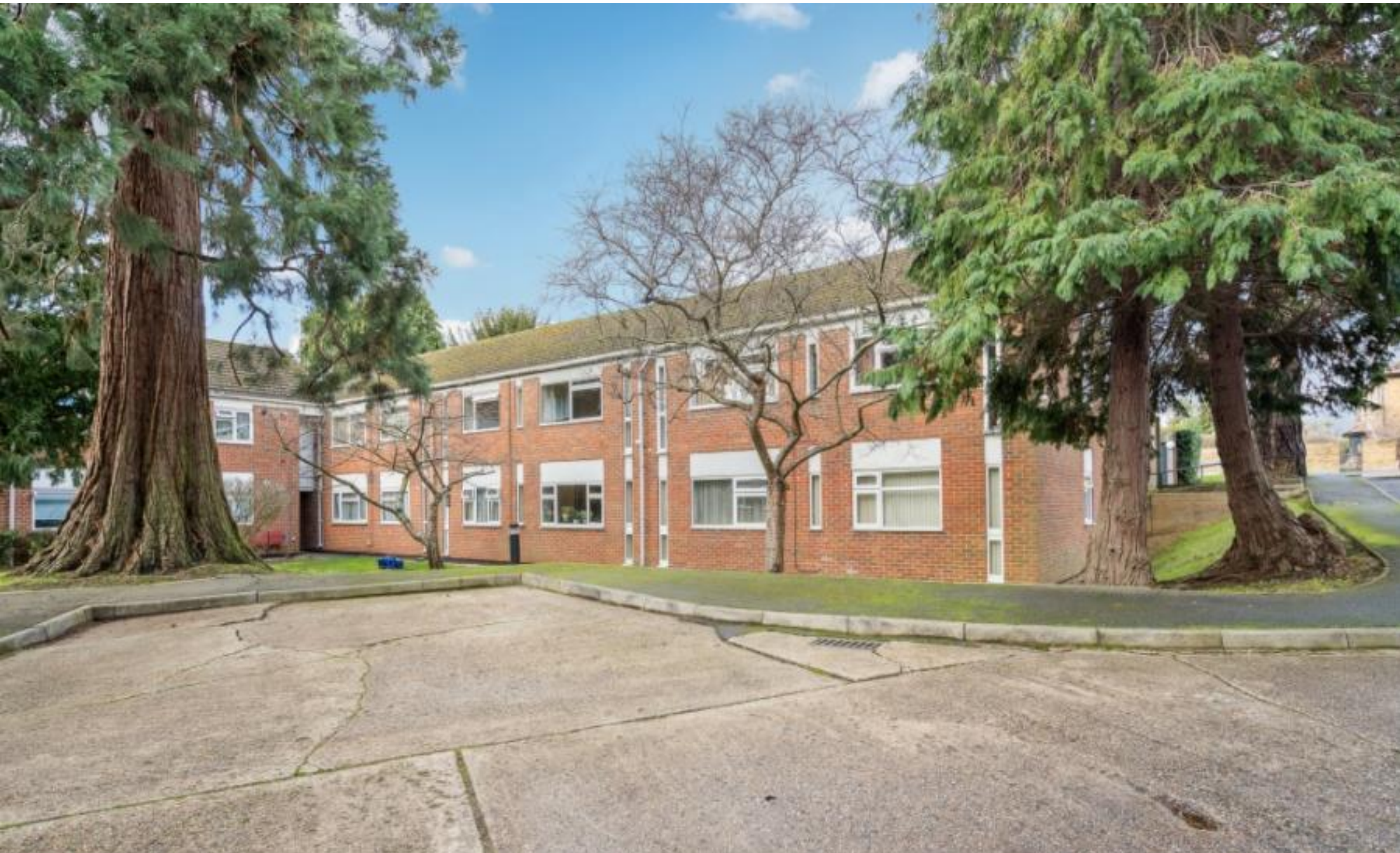
A well presented two bedroom ground floor apartment in a sought after area Burhill Grove, Pinner, HA5 3DW