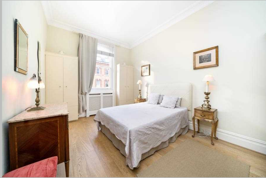
A stunning two bed apartment within this beautiful period building in South Kensington