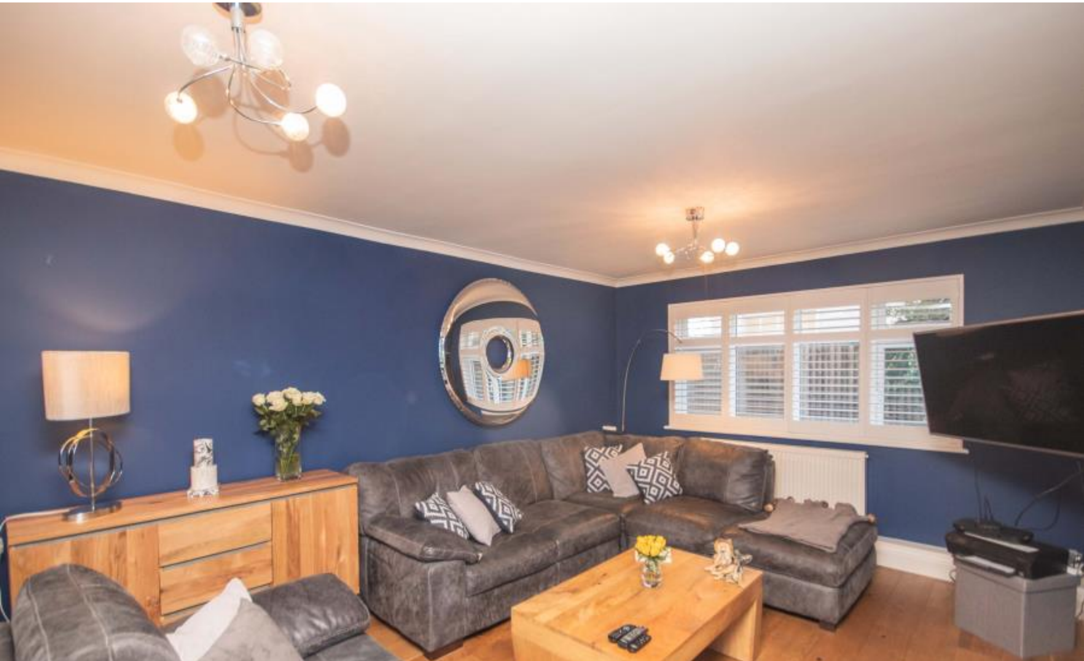
A stylish ground floor apartment with rear garden North End Lodge, Elm Park Road, HA5 3LA