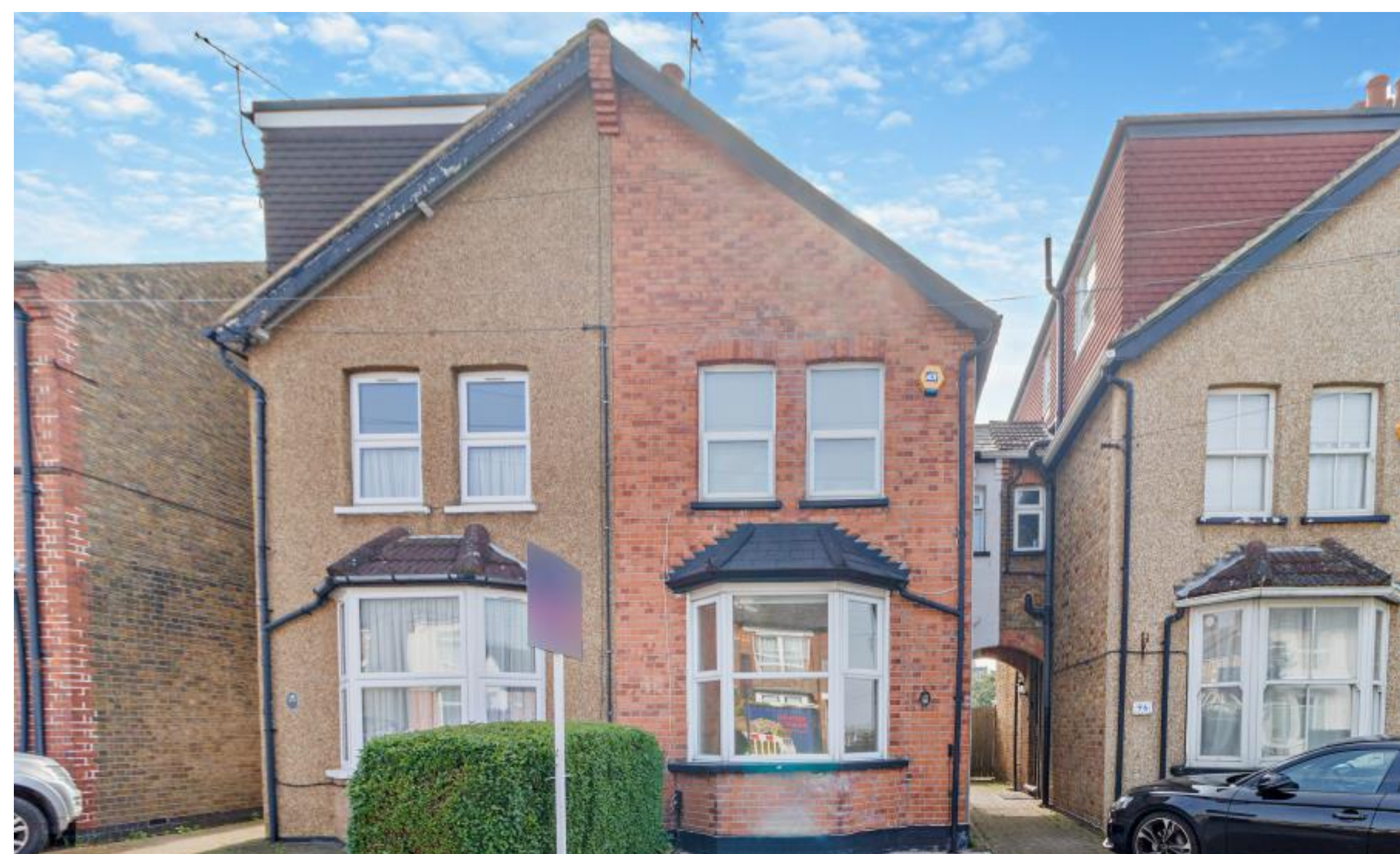
A 2/3 bedroom family home located in the heart of Old Northwood High Street, Northwood, Middlesex HA6 1BJ